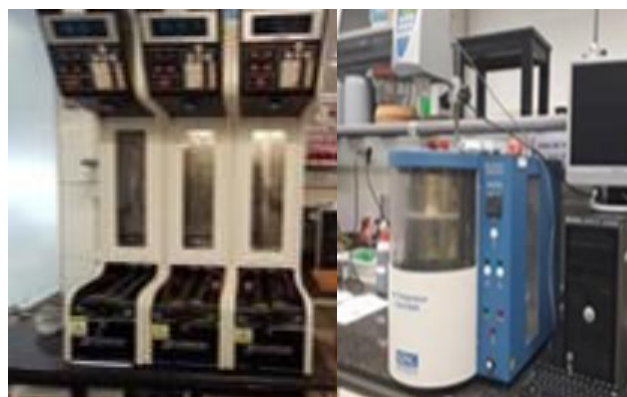
Kinematic and Brookfield equipment